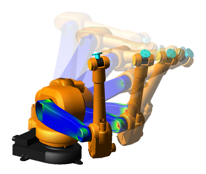
DOE Simulation in Adams

For a complete list of MSC Technology Partners who provide these capabilities, view <a href="http://partners.mscsoftware.com">http://partners.mscsoftware.com</a>